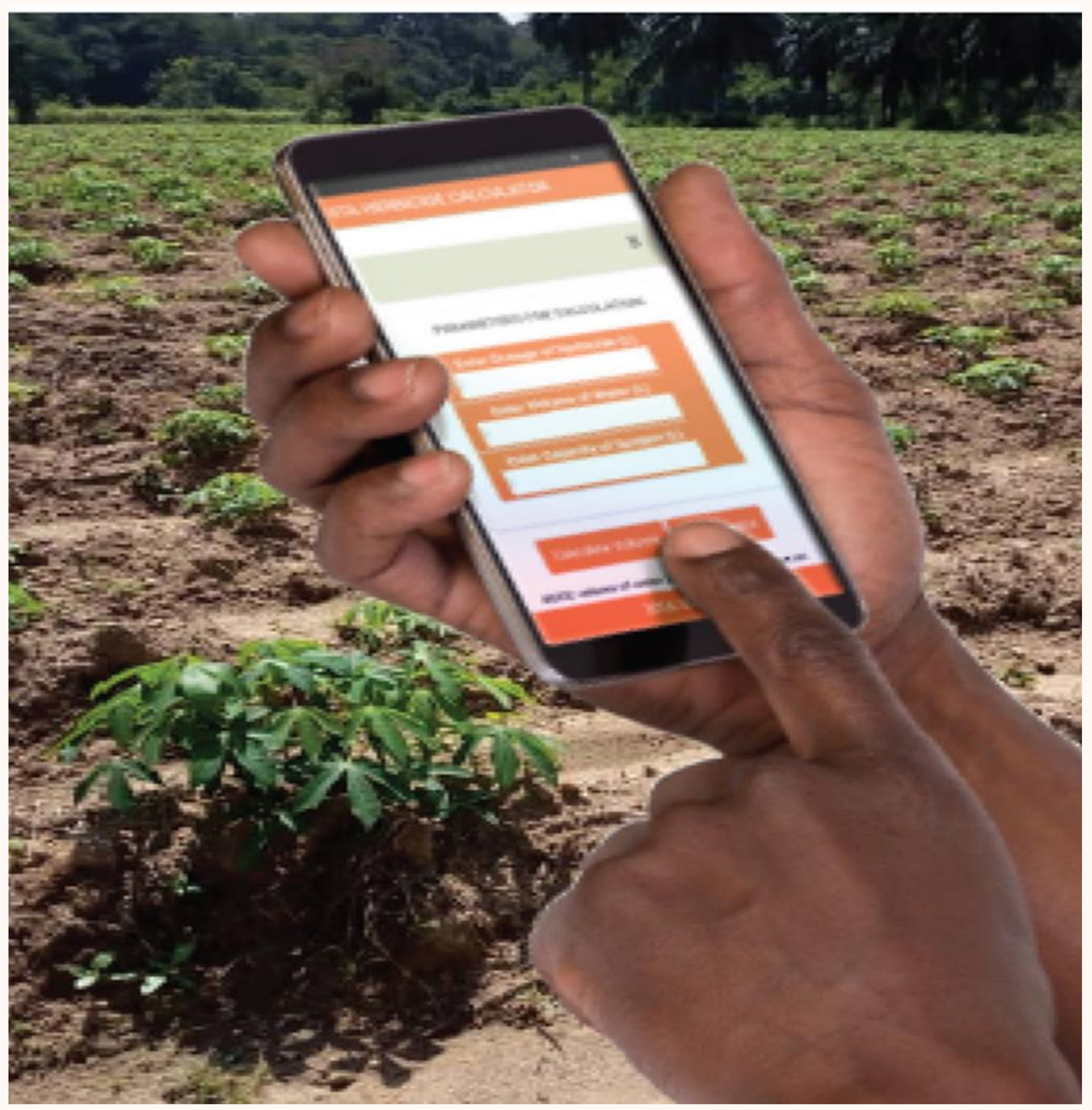
Fig. 2: Features of the IITA Herbicide Calculator.

The IITA Herbicide Calculator was developed by IITA using in-house capacity to help farmers and applicators of herbicides to calibrate themselves and apply the right quantity of herbicide per knapsack spray tank to avoid either overdosing or underdosing which leads to poor weed control, economic waste, development of resistant weeds, and environmental pollution.