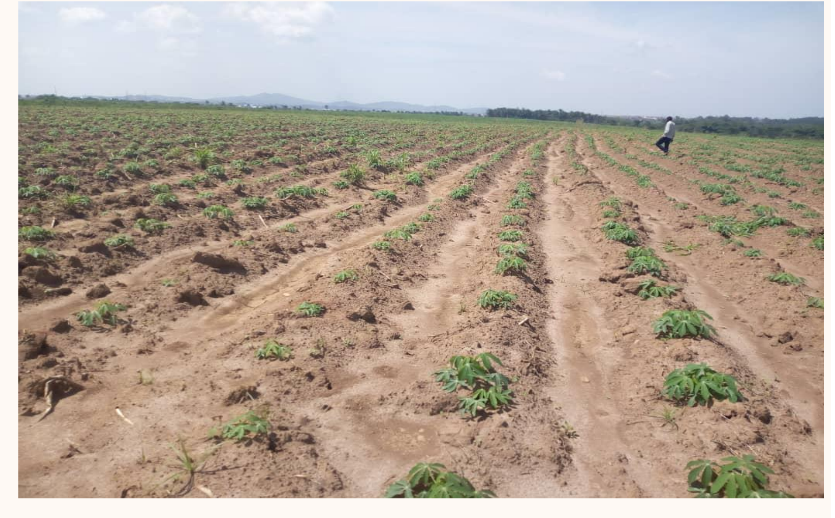
Fig. 5: A field where IITA Herbicide Calculator was used to apply herbicides.