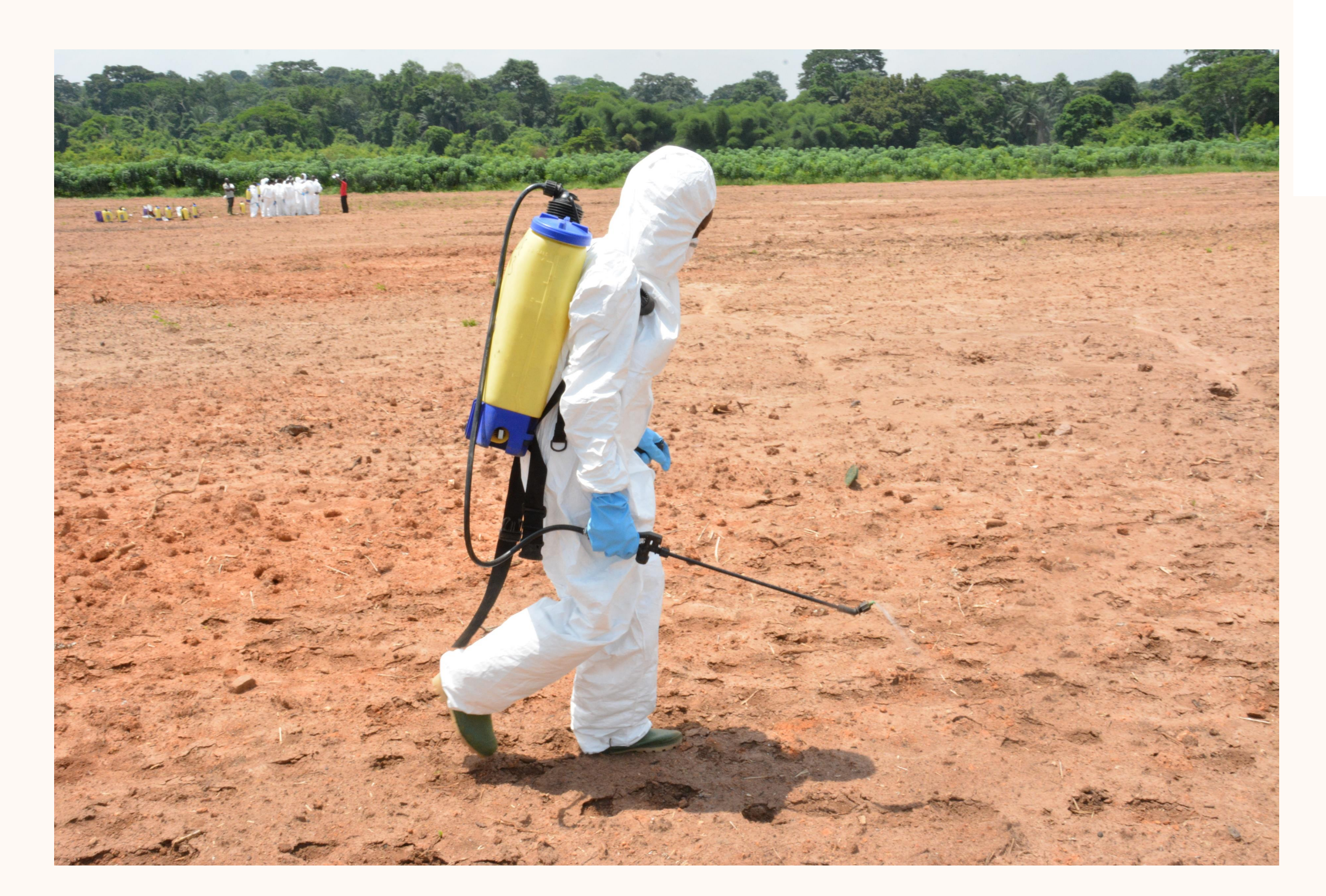
Fig. 1: Herbicides application with knapsack sprayer.

Efforts to intensify cassava production have been stymied by weed infestations, which are mostly controlled by the use of hand (hoe) weeding—a system that is crude and drudgery-driven. Women spend hundreds of hours per annum to weed cassava (hoe weeding takes 50 to 80% of the total labor budget in Nigeria). In some cases, children are withdrawn from school to support weeding. To avoid the drudgery of hoe weeding, many rural farming communities in Africa are using herbicides with the help of knapsack sprayers. However, the challenge many farmers face is mostly wrong application of herbicides as many cannot manually calculate the quantity of herbicide needed to load in the sprayer per given operation.