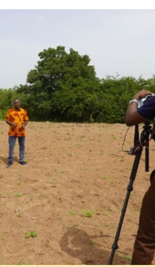
Shooting of one of the episodes of Cassava Matters TV

The Six Steps to Cassava Weed Management and Best Planting Practices toolkit, popularly called "Six Steps..." is a complete package that addresses all aspects of good agricultural practices in cassava production. Nigerian farmers using the "Six Steps..." get more than 20 tons per hectare of cassava roots, which is above the current national average of 9 tons per hectare. The toolkit prescribes best bet practices in site selection, weed identification, preemergence herbicides application, tillage operations, use of improved planting materials, plant spacing, and post-emergent weed management. The "Six Steps..." has been integrated into AKILIMO, a comprehensive digital advisory service for cassava.