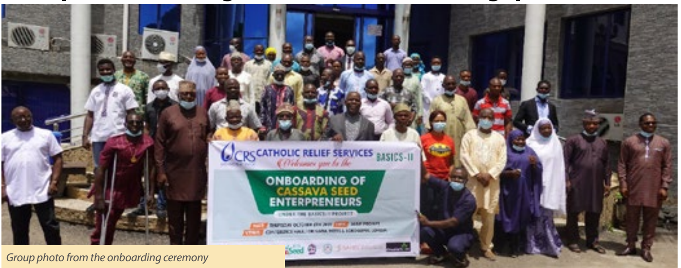
Group photo from the onboarding ceremony

The International Institute of Tropical Agriculture (IITA) led Building an Economically Sustainable Integrated Cassava Seed System, Phase 2 (BASICS-II) on Thursday enlisted 45 farmers in Kogi state as cassava seed entrepreneurs (CSEs).