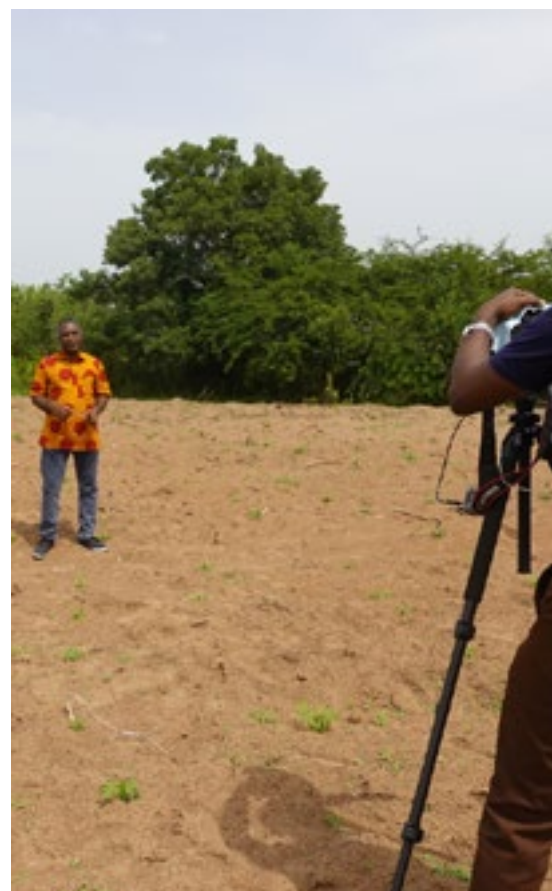
Shooting of one of the episodes of Cassava Matters TV

The Six Steps to Cassava Weed Management and Best Planting Practices toolkit, popularly called "Six Steps..." is a complete package that addresses all aspects of good agricultural practices in cassava production. Nigerian farmers using the "Six Steps..." get more than 20 tons per hectare of cassava roots, which is above the current national average of 9 tons per hectare. The toolkit prescribes best bet practices in site selection, weed identification, preemergence herbicides application, tillage operations, use of improved planting materials, plant spacing, and post-emergent weed management. The "Six Steps..." has been integrated into AKILIMO, a comprehensive digital advisory service for cassava.