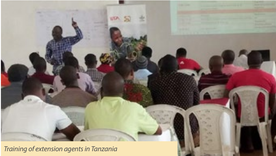
Training of extension agents in Tanzania

The African Cassava Agronomy Initiative (ACAI) project held a training session for the Tanzanian government extension officers on the use of Fertilizer Recommendation (FR), Weed Management and Best Planting Practices (WM/BPP) and Scheduled Planting and High Starch Content (SPHS) and the operation of various formats of the AKILIMO toolkit.