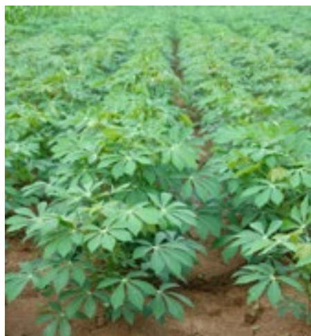
Clean cassava field

The Central Bank of Nigeria (CBN) says only farmers who grow improved disease-free cassava stems will have access to the N25billion facility it has created to boost cassava production in the country.