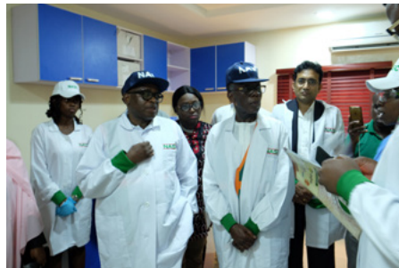
Nigeria's Minister of Agric, Chief Ogbeh (middle) flanked by BASICS and NASC team in Abuja