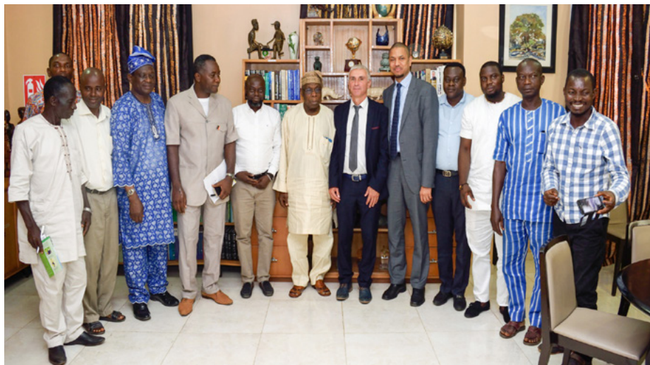
Former President Obasanjo (middle) with Bayer and IITA team in Nigeria

Nigeria's former President, Chief Olusegun Obasanjo has agreed to support the dissemination of improved technologies on weed control and other agricultural innovations to farmers, as part of efforts to bring about agricultural transformation in Africa.