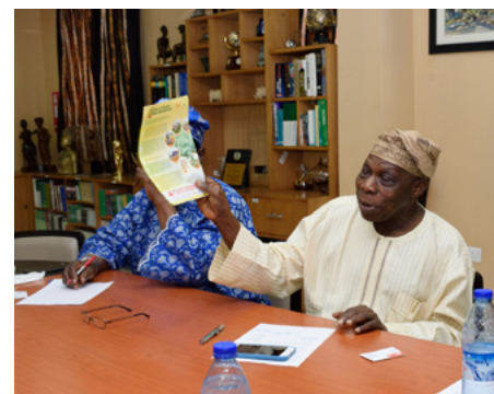
Let's promote this toolkit: Former President Obasanjo impressed with the Six Steps to Cassava Weed Management toolkit