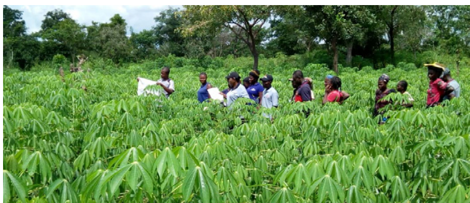
Farmers evaluating IITA-CWMP fields to determine the efficacy of the Six Steps to Cassava Weed Management toolkit

Participating farmers in the field days revealed that they would want to adopt the step-by-step approach outlined in the toolkit that was shared with them so as to get the results seen on the demo plots in each of their communities.