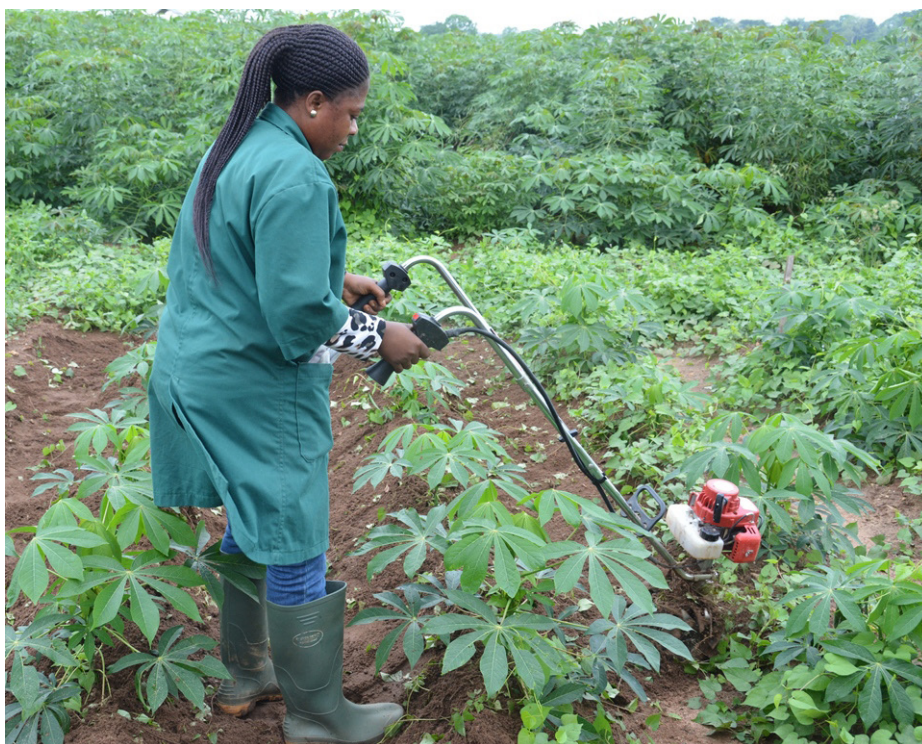
A woman using a motorized mechanical weeder to weed in a cassava farm

Under the IITA-CWMP, the TAAT program is considering the mechanical weeding and herbicides options for its cassava intensification component. The