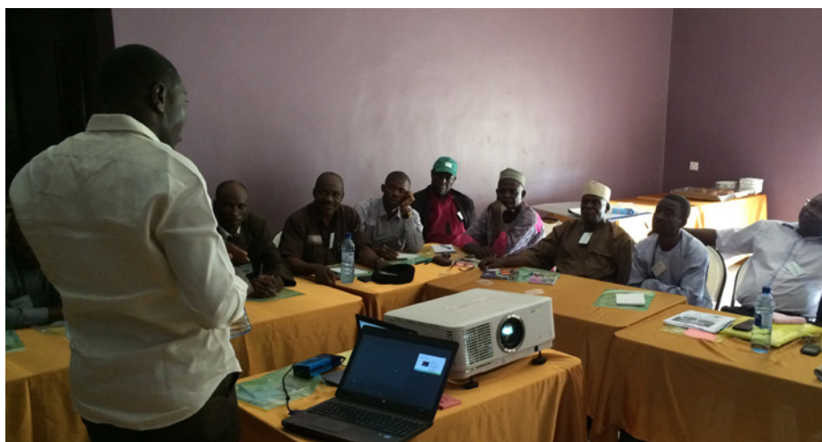
Participants in a training session

In the coming months, teams from NASC and NRCRI will travel to the United Kingdom, and East Africa to learn the best practices in seed certification and adapt them to suit the local context in Nigeria. NASC is also planning to set up a world class 'Center of Excellence' for seed certification in Sheda near Abuja. Due to the bulky nature and high quantities