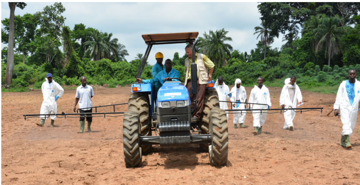
Participants during a practical session

The IITA-Cassava Weed Management Project has conducted a Training of Trainers program for 60 persons including extension service providers, spray service providers, and other partners.