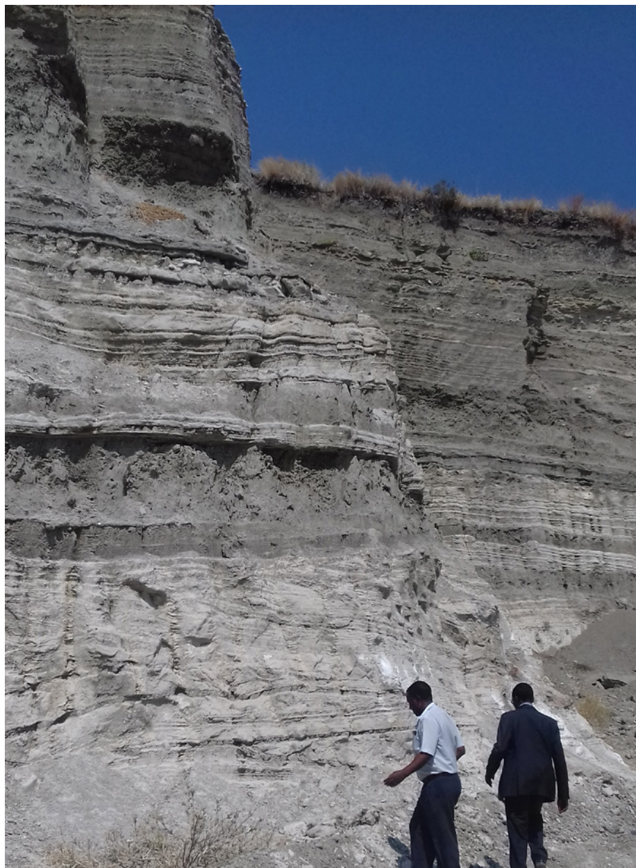
Phosphate layers at Minjingu site.