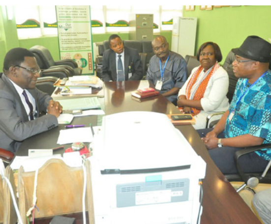
ACAI team with CAVA II in FUNAAB