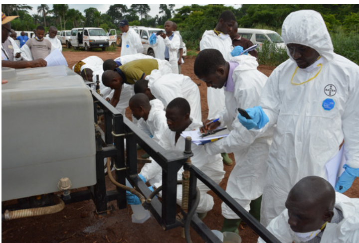
Caliberating a boom sprayer