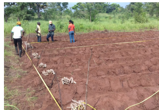
Setting the trial