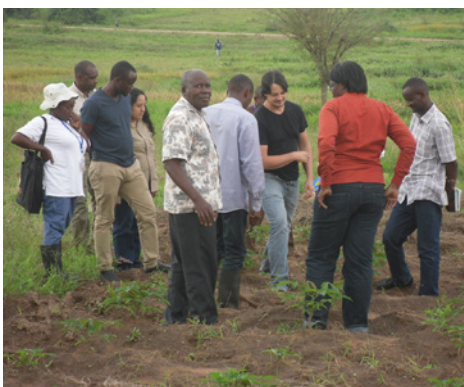
ACAI team inspecting a farmer's field in Sengerema

not only undermine the potential of the crop but also leads to nutrient mining in the already impoverished soils. "This situation can only lock the farmers into perpetual poverty," he said. He expressed optimism that the results of the fertilizer trials would not only enable the farming community to appropriately manage soil fertility but also minimise costs through the targeting of appropriate nutrient dosage that would reduce costs and maximise yields.