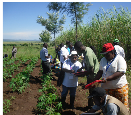
Field work in Tanzania

The training covered non-destructive sampling, data management and modelling . An evaluation after the training revealed that participants had enhanced capacity in collecting key morphological traits of cassava as well as associated intercrops (sweet potato and maize). Participants were also taught how to electronically record data using the Open Data Kit (ODK), which ensures safe storage of data as well as processing for analysis. In addition, the participants had an insight into modelling with a view to adapting the cassava growth model to African conditions.