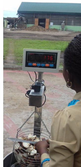
Estimating starch content of cassava at Psaltry processing site

supply. He informed the team that they have installed equipment that determines the starch content of each batch of cassava supplied and that they pay suppliers according to the total starch content of cassava roots. He welcomed the ACAI Staggered Planting experimentation that is investigating the variation of starch content with variety as well as season and management practice particularly fertilization. Mr Vandy is looking forward to the results that will enable farmers to have higher root yields as well as higher starch content.