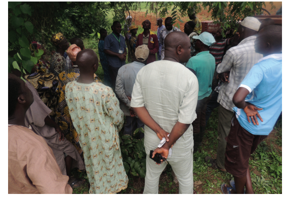
Farmers are being mobilized as on-farm kicks -off

Though Nigeria is a global leader in cassava production, the average yield on farmers' fields is about 14 tons per hectare, representing half of those obtained on research stations. One of the limiting factors to increased