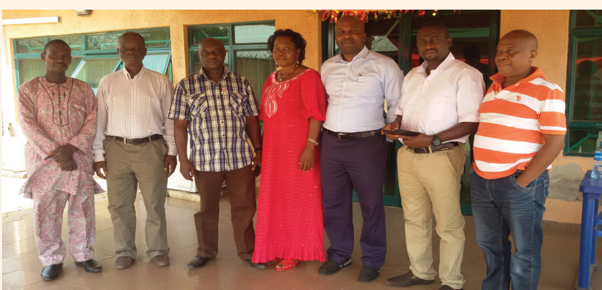
IITA and UAM staff in Makurdi, Benue State