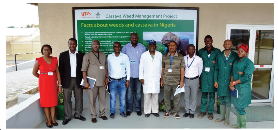
AATF, IITA-CWMP and IITA Youth Agripreneurs

Excited by the youth activities and in particular the mechanical weed control option, both teams agreed in principle to involve the youths in their activities either as service providers or to help the youngsters by offering services to them at scale.