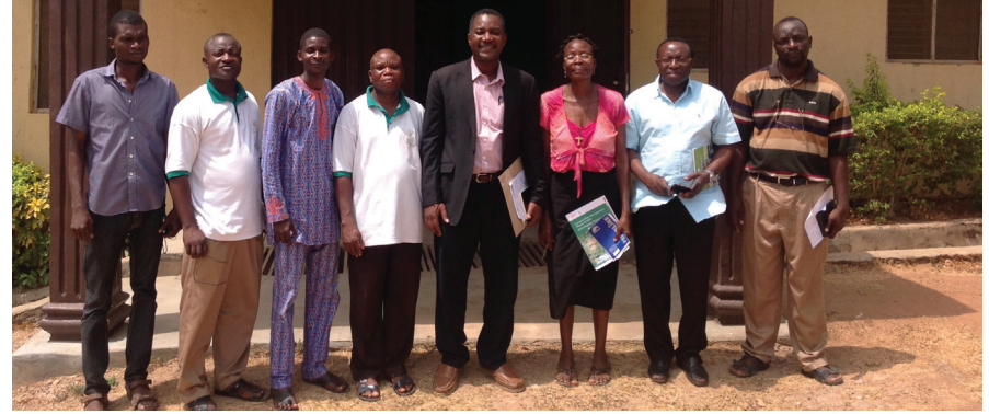
IITA-CWMP and JDPM in Oyo town

Weed Management team at FUNAAB with extension services. In Abia, the IITA CWMP established collaboration with KOLPING another arm of the Catholic Church that is also involved in rural development. The organization linked the project team with their farmers. KOLPING has more than 600 farmers working under its programs in Abia state.