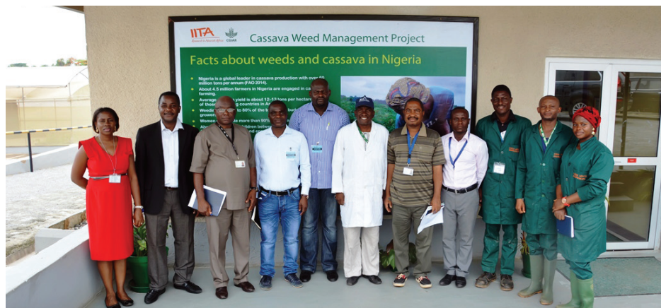
AATF, IITA-CWMP and IITA Youth Agripreneurs

Excited by the youth activities and in particular the mechanical weed control option, both teams agreed in principle to involve the youths in their activities either as service providers or to help the youngsters by offering services to them at scale.