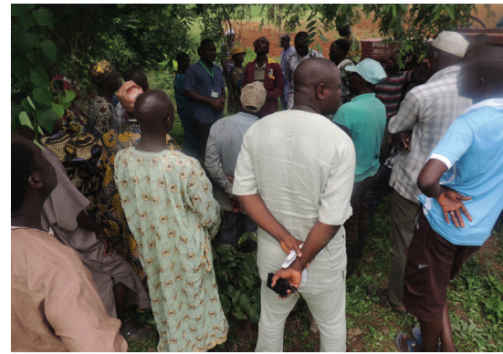
Farmers are being mobilized as on-farm trials kick-off

Though Nigeria is a global leader in cassava production, the average yield on farmers’ fields is about 14 tons per hectare, representing half of those obtained on research stations. One of the limiting factors to increased