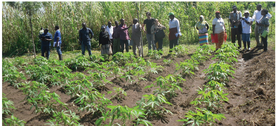
Researchers and farmers in a field trial

The ACAI project plans 667 trials in both Nigeria and Tanzania across the four use cases directly associated with field experimentation. These are as follows: fertilizer recommendation (295); best planting practices (150); intercropping (202), and staggered planting (20).