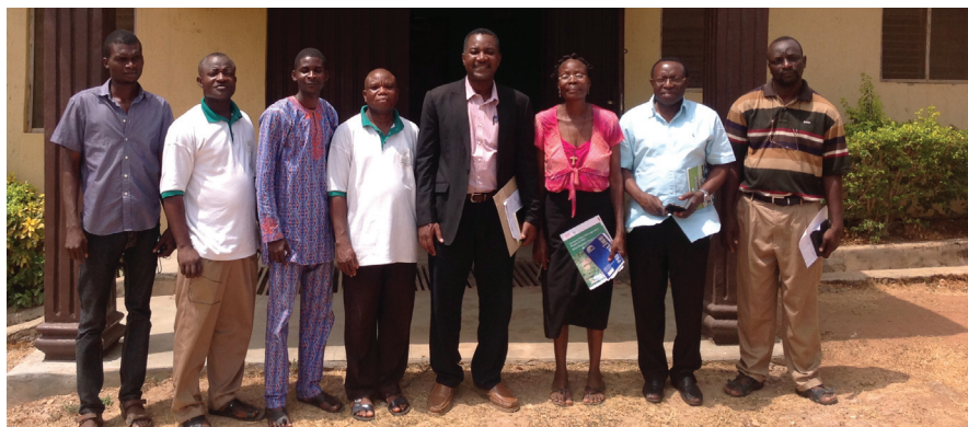
IITA-CWMP and JDPM in Oyo town

Weed Management team at FUNAAB with extension services. In Abia, the IITA CWMP established collaboration with KOLPING—another arm of the Catholic Church that is also involved in rural development. The organization linked the project team with their farmers. KOLPING has more than 600 farmers working under its programs in Abia state.