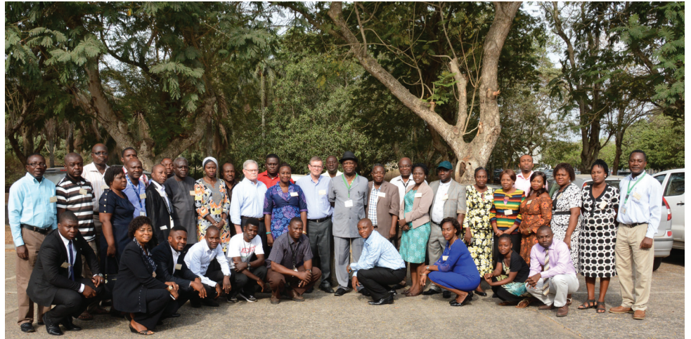
Participants and facilitators at the training program