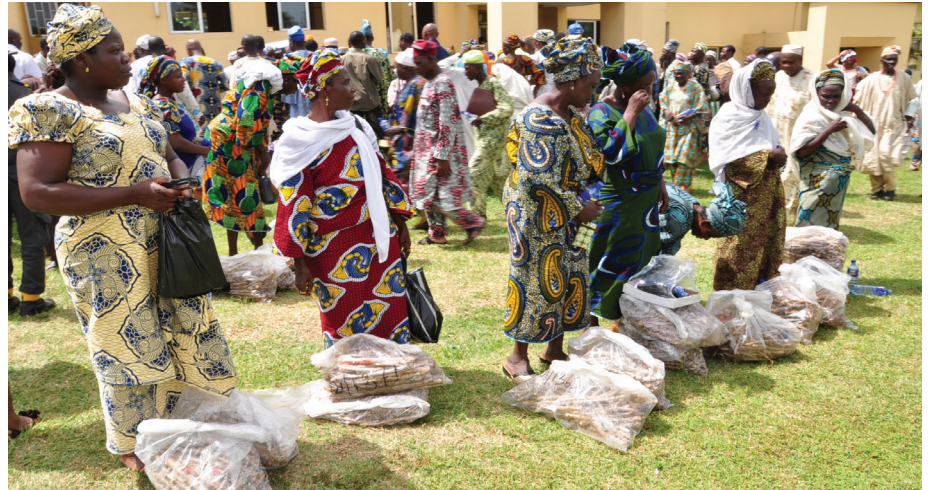
From the archives: Women farmers get improved cassava stems during an IITA organized field