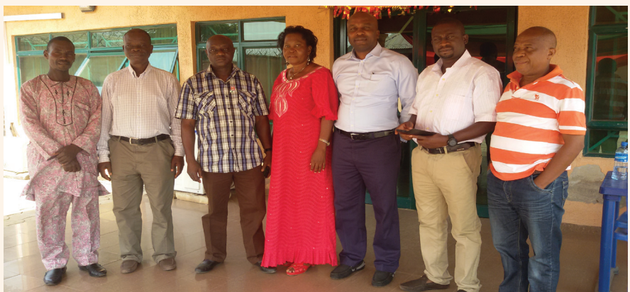
IITA and UAM staff in Makurdi, Benue State