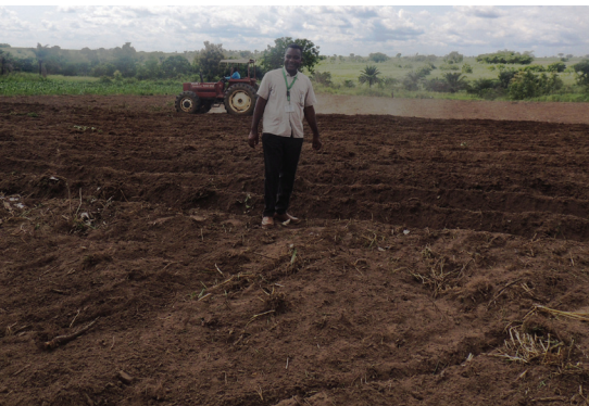
Land preparation begins for 2016 on-farm trials