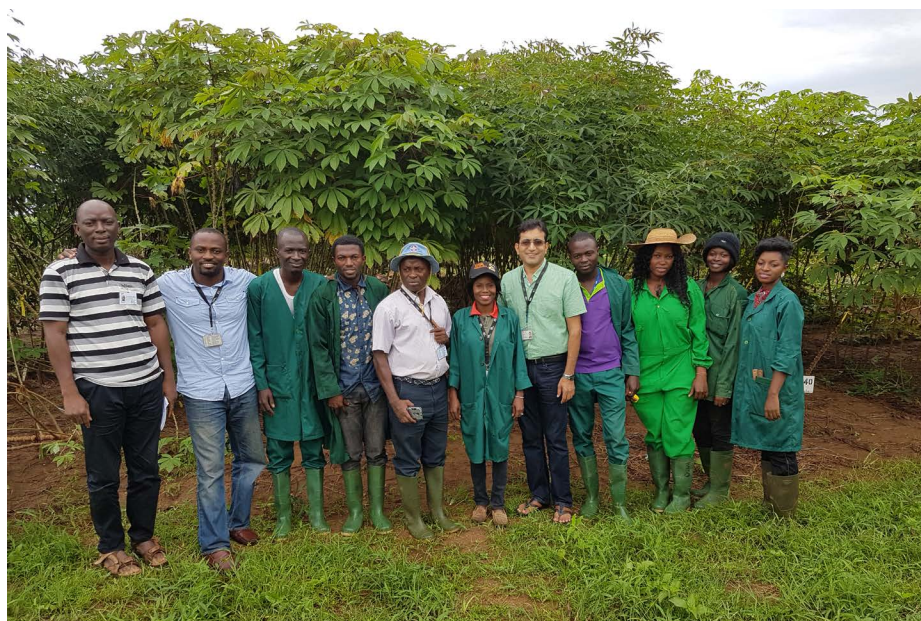
BASICS team in front of SAH originated cassava field shortly before harvest

Researchers working under the Building an Economically Sustainable Integrated Cassava Seed System (BASICS) project have harvested the first ever plots of cassava stems derived from a novel cassava propagation system, the Semi-Autotrophic Hydroponic (SAH). The historic harvest, the first of its kind in cassava, was done on 13 September 2017 from fields in IITA-Ibadan, Nigeria.