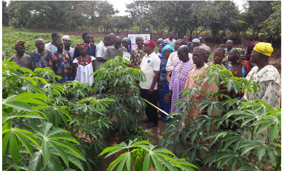
Farmers during a farmers' field day facilitated by IITA-CWMP and JDPM Oyo