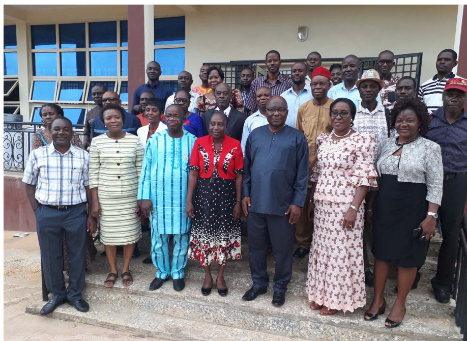
Participants at the Joint Quarterly Review Meeting of IITA-CWMP in Abeokuta, Ogun State, Nigeria

messages across to farmers using the radio and other innovative methods.