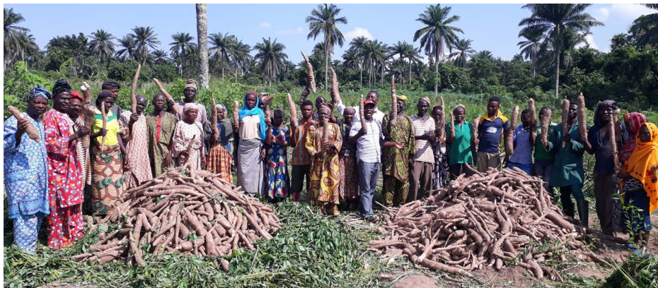
Farmers celebrating their cassava from a demonstration plot

On-farm demonstrations in Ogun state, Nigeria under the IITA Cassava Weed Management Project have produced average yields of 27 tons per hectare surpassing the national average of about 8 tons/ha.